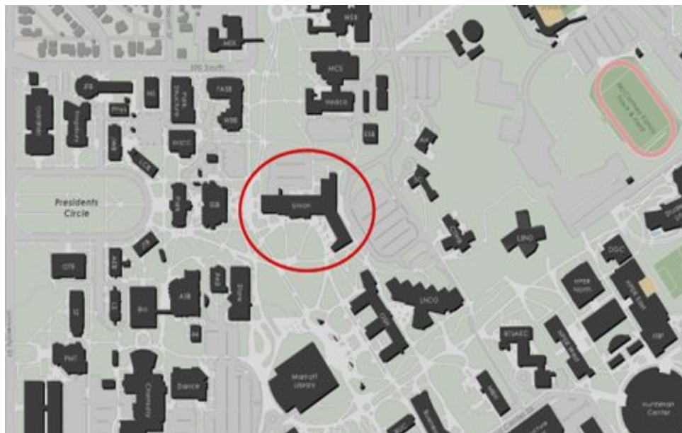
REDMED EMPLOYEE HEALTH CLINIC 200 Central Campus Dr. Salt Lake City, UT 84112